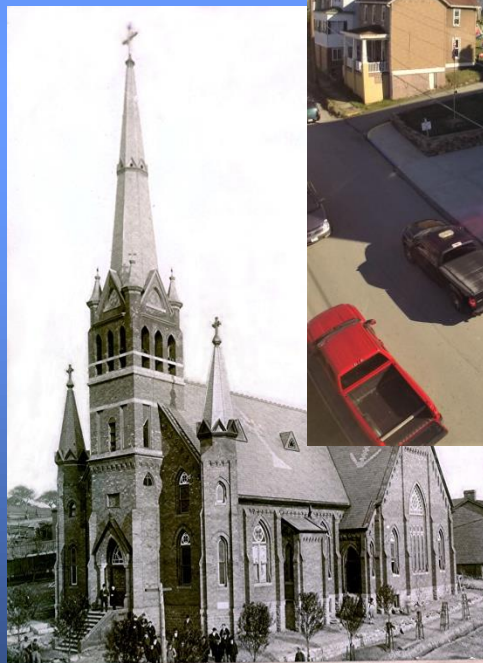
St. Joseph's Polish R. C. Church.